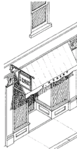
Figure 2: Awning Sign